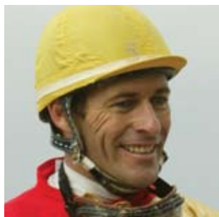
▲ Gary Stevens has seven Kentucky Cup wins, including the 1996 Turfway Breeders' Cup aboard Golden Attraction, champion two-year-old in 1995.